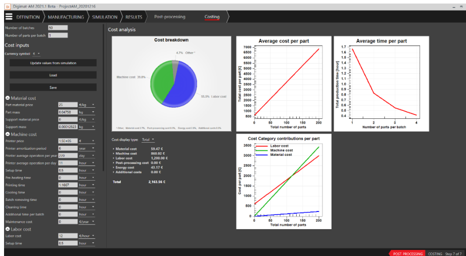
Production cost analysis using Digimat additive manufacturing